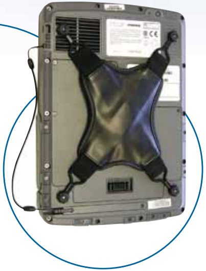
GoBook® Tablet PC

implementing rugged mobile Solutions for your enterprise