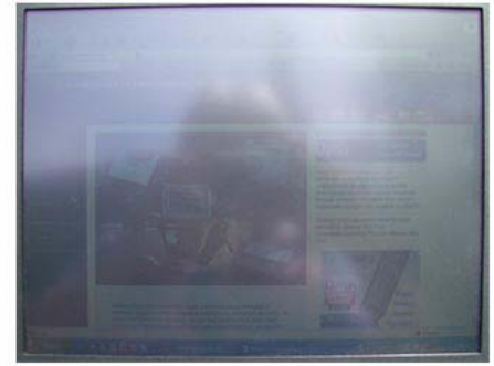
Above: Direct sunlight comparison: DynaVue versus conventional display

ties to virtually eliminate reflection and preserve contrast. That means exceptional viewability in all lighting conditions. Needless to say, that can be a huge selling point. We spent a lot of time analyzing the VR-2's screen outdoors and came away more than impressed. Pen Computing and RuggedPCReview.com's technology editor Geoff Walker wrote a detailed article entitled The Ultimate Outdoor-Readable Touch-Screen Display on the technology at http://www.ruggedpcreview.com/3_technology_itronix_dynavue.html .